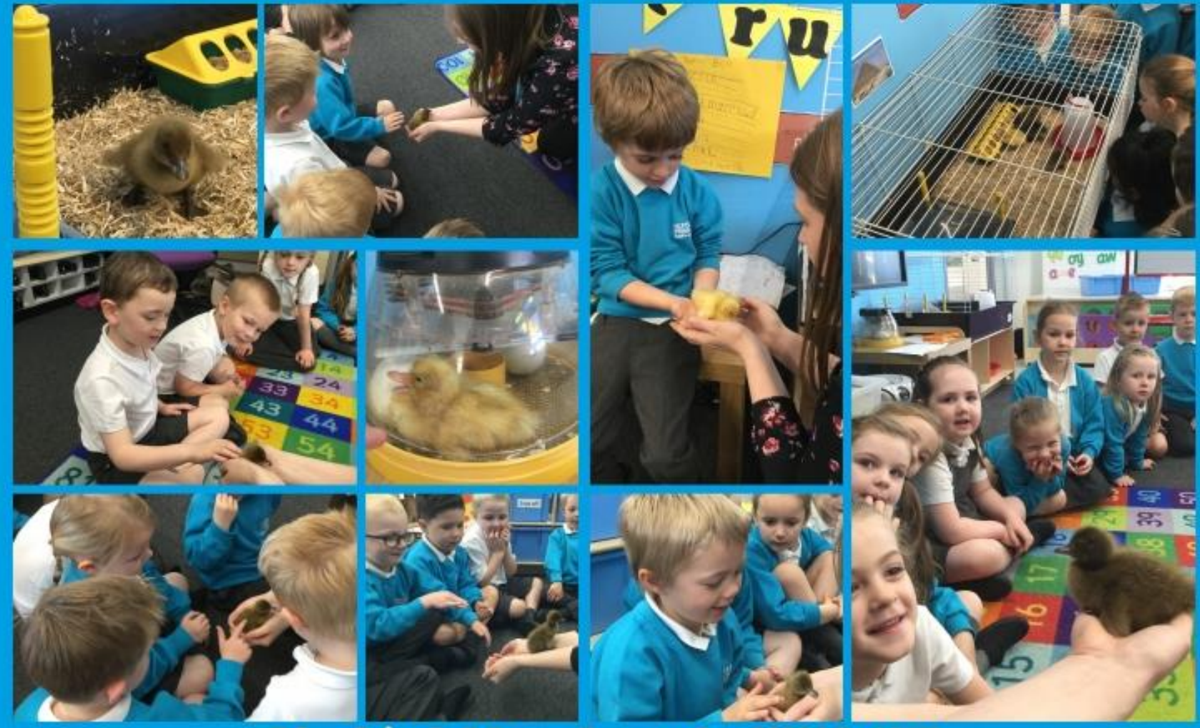
Bluebird Way, Brough, HU15 1XB